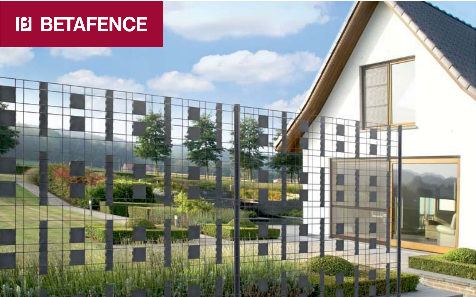
Zenturo + pixel infill